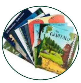
NEW Library Books to enhance student reading experiences