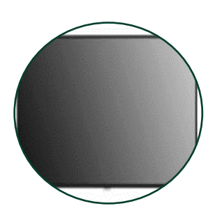
NEW Foyer TV Screen for enhanced in school communications