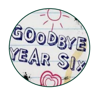
CONTRIBUTED to the Y6 Leavers Gifts