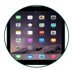
REPLENISHMENT of I-Pad Stocks for enhanced student learning