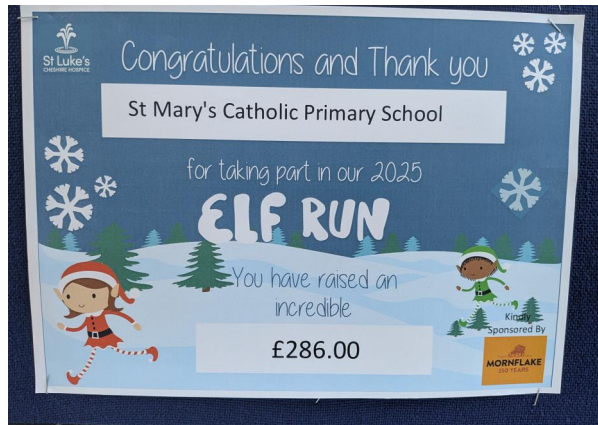
1 - St Luke's Elf Run 2025