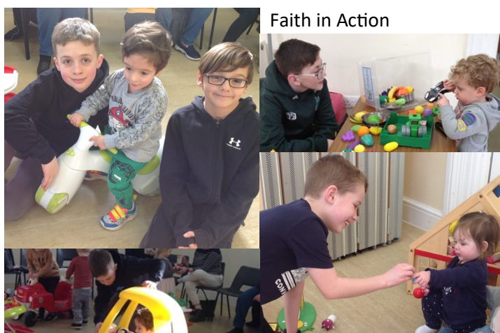
Faith in Action

MIDDLEWICH FLOWERING MEADOWS is a team of volunteers whose aim is to make Middlewich blossom by planting perennials and wildflowers in various locations around town. There is an opportunity for school to be involved in planting seeds in Brynlow Drive on Friday, 24th March at 10.30am. We hope the Mini Vinnies and the Eco team will be able to get involved.